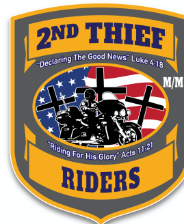
Riders Shield 2