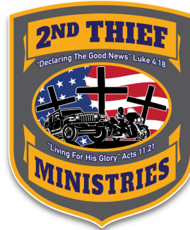
2 nd Thief Ministries Shield (w/tools)