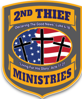
2 nd Thief Ministries Shield