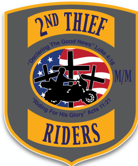
Riders Shield 1: The Original

Upon confirmation and installation of a 2 nd Thief Rider Chapter, that Chapter is authorized to fly the colors below, including any patches, emblems, and other 2 nd Thief Riders' merchandise or apparel. Shield 1 (the original 2 nd Thief patch) is the only patch authorized to be flown as "Colors" on the back of vests. Shield 2 may be displayed on other merchandise, banners, flyers, etc., as appropriate and approved by Chapter Coordinators or National Leadership.